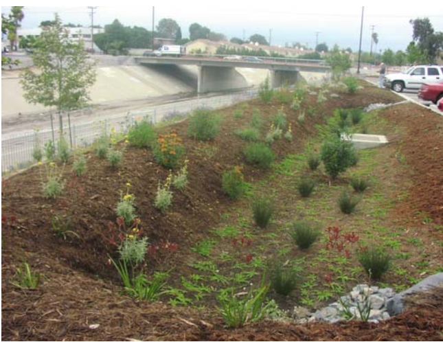
Bioretention Cells – 06/10/09 Completed bioretention cells