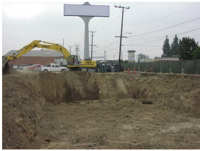
Underground Infiltration Basin – 09/08/08 Excavation of Underground Infiltration Basin No. 2 near the Southern

Excavation of Underground Infiltration Basin No. 2 near the Southern property line adjacent to Lower Azusa Road.