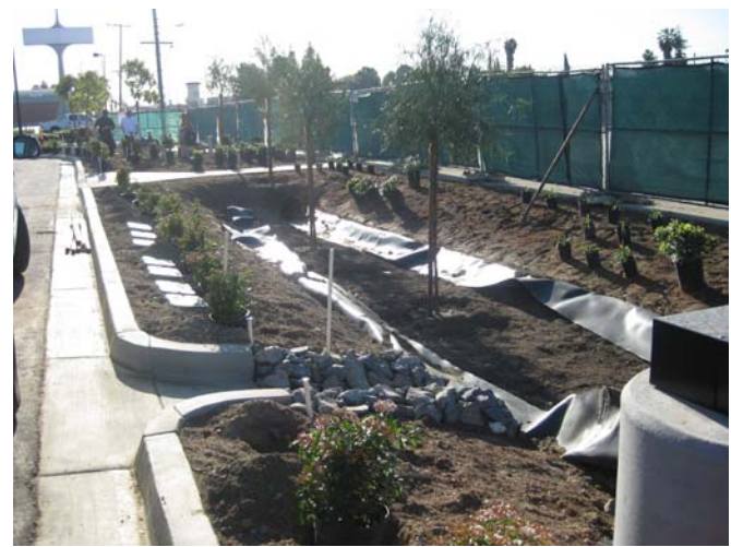
Bioretention Cells -- 03/23/09

Installation of landscaping and irrigation within the Bioretention Cell. Note rip-rap velocity dissipation installed at curb openings.