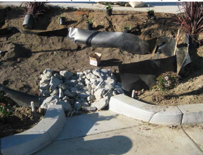
Bioretention Cells -- 03/23/09

Installation of landscaping and irrigation within the Bioretention Cell. Note rip-rap velocity dissipation installed at curb openings.