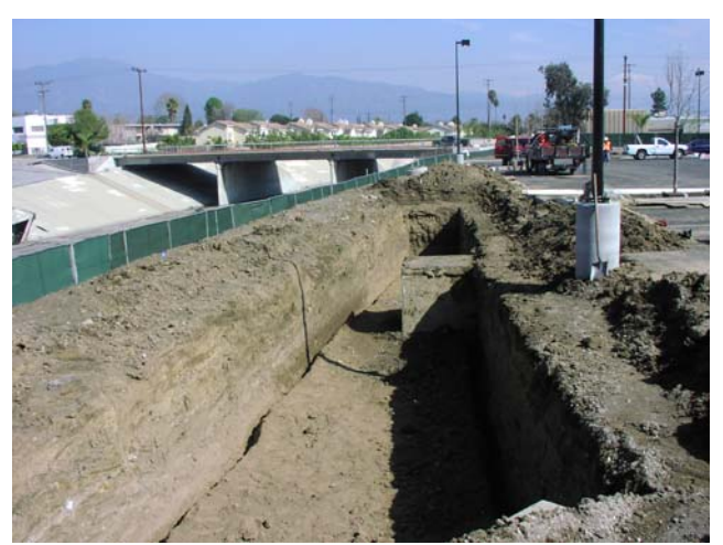
Bioretention Cells -- 02/11/09

Installation of Bioretention Cell. Note the storm drain inlet with underdrain stub-out, and the vertical impermeable liner.