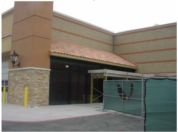
Outdoor Storage Area -- 04/23/09

The fueling area is covered by a canopy and the roof drains are connected to an underground infiltration basin. Stormwater runoff flows drain away from fueling area and the area drain under the canopy is connected to an oil stop valve in case of an accidental spill and nuisance water drainage..