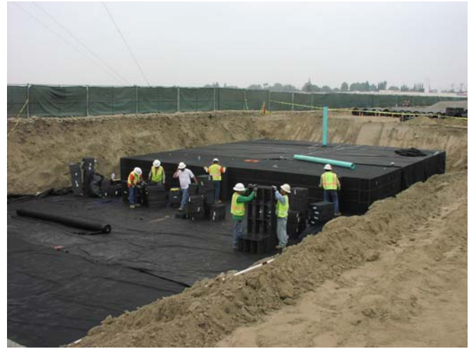
Underground Infiltration Basin – 09/11/08 Installation of Underground Infiltration Basin No. 2, near the Southern property line Note permeable geo-fabric and clean-out portals.