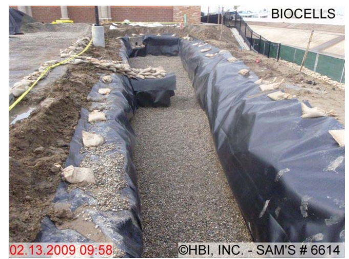
Bioretention Cells -- 02/13/09

Installation of Bioretention Cell. Note the storm drain inlet with underdrain stub-out, the gravel sub-base & the vertical impermeable liner.