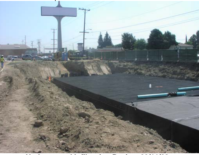
Underground Infiltration Basin – 09/11/08 Installation of Underground Basin 2, near the Southern property line Note permeable geo-fabric and installation nearly complete.