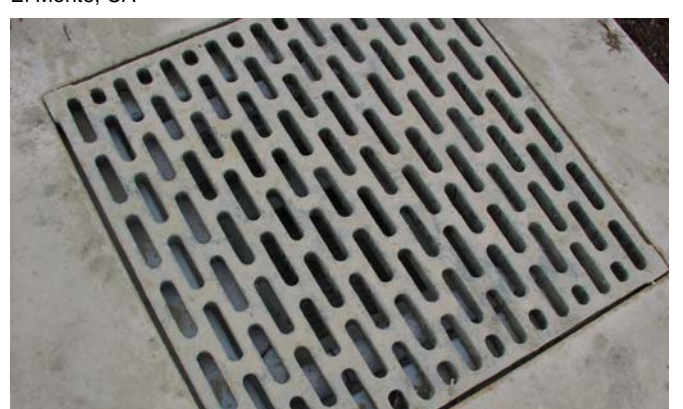
Inlet Insert 04/23/09 The storm drain inlet insert was installed to remove trash, debris, and