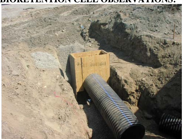
Storm Drain - 10/02/08

Installation of concrete forms for the concrete anchors and storm drain piping at the edge of the bioretention cells to limit water seepage through the storm drain trench.