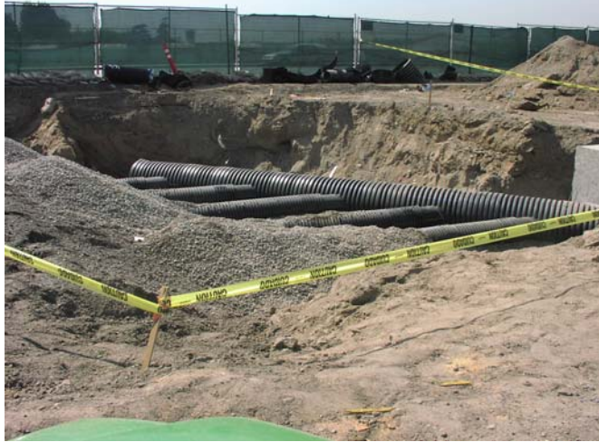
Underground Infiltration Basin – 10/02/08 Installation of the outlet structure and storm drain pipes near the discharge of Underground Infiltration Basin No. 2.