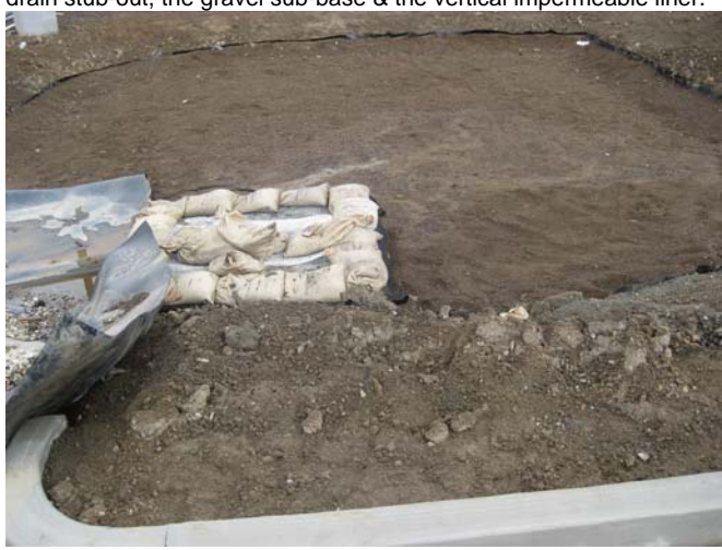
Bioretention Cells -- 03/04/09

Installation of Bioretention Cell. Note the storm drain inlet with underdrain stub-out, the gravel sub-base & the vertical impermeable liner.