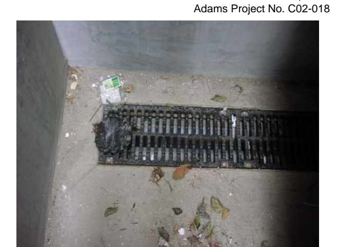
Truck Well – Inlet Insert 04/23/09 The truck well drain inlet insert was installed to remove trash, debris, and oils