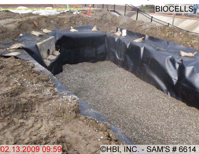
Bioretention Cells -- 02/13/09

Installation of Bioretention Cell. Note the amended soils have been installed and landscaping activities have begun