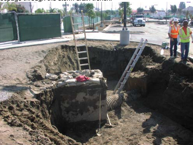
Bioretention Cells -- 02/11/09

Installation of concrete forms for the concrete anchors and storm drain piping at the edge of the bioretention cells to limit water seepage through the storm drain trench.