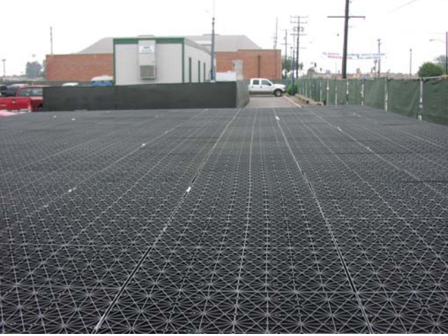
Underground Infiltration Basin - 09/08/08

Excavation of Underground Infiltration Basin No. 2 near the Southern property line adjacent to Lower Azusa Road.