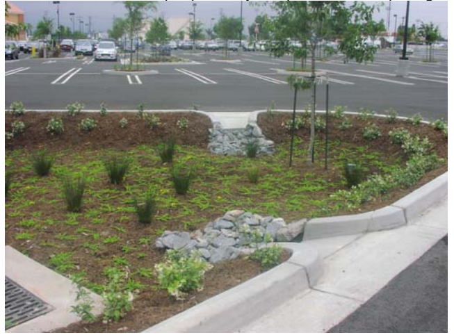
Bioretention Cells – 06/10/09 Completed bioretention cells

Installation of wood mulch as the top filter layer within the Bioretention Cell. Note rip-rap velocity dissipation at curb openings.