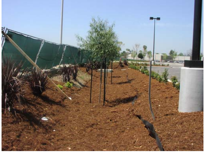
Bioretention Cells - 04/07/09

Installation of landscaping and irrigation within the Bioretention Cell. Note rip-rap velocity dissipation installed at curb opening.