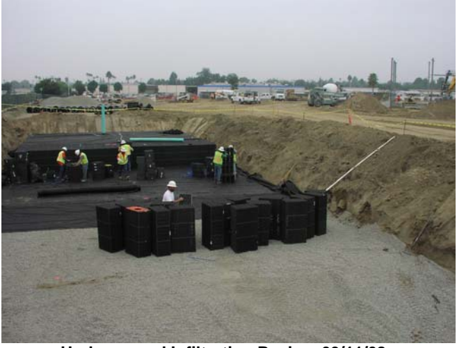
Underground Infiltration Basin – 09/11/08 Installation of Underground Basin No. 2, near the Southern property line Note the gravel base and permeable geo-fabric.