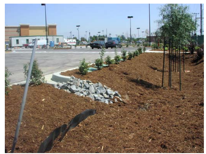
Bioretention Cells - 04/07/09

Installation of final layer of wood mulch as a part of the filter within the Bioretention Cell. Note rip-rap velocity dissipation at curb openings