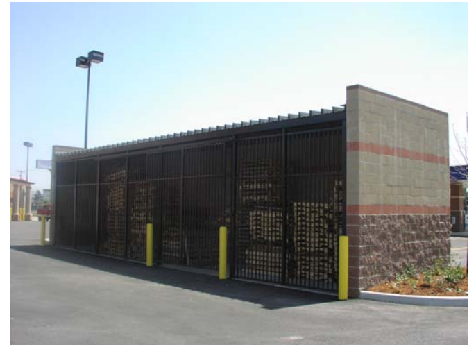
Outdoor Storage Area -- 04/07/09

The outdoor pallet recycling storage area is protected by an impermeable roof, and surface runoff flows drain away from this area.