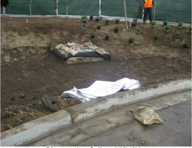
Bioretention Cells -- 03/04/09

Installation of Bioretention Cell. Note the amended soils have been installed and the area is nearly at finished grade. .