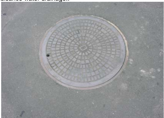
Fueling Station Oil Stop Valve -- 06/10/09

The fueling area is covered by a canopy and the roof drains are connected to an underground infiltration basin. Stormwater runoff flows drain away from fueling area and the area drain under the canopy is connected to an oil stop valve in case of an accidental spill and nuisance water drainage..