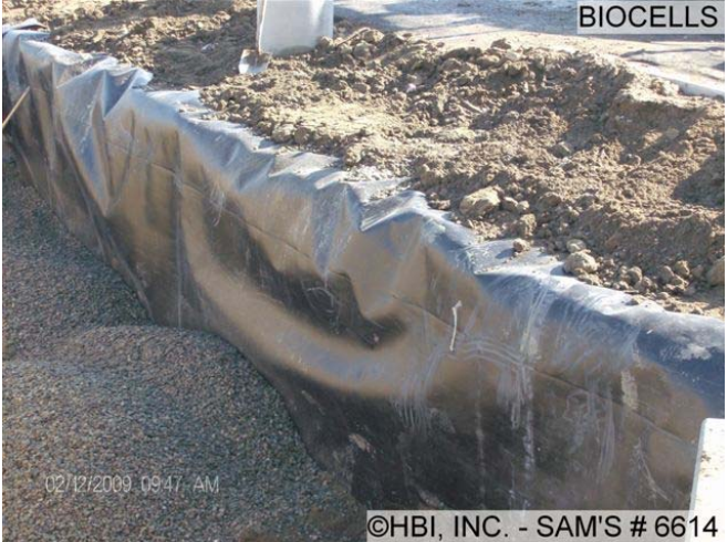
Bioretention Cells -- 02/12/09

Excavation of exiting soil at Bioretention Cell. Note the storm drain inlet and pipe for overflow discharges.