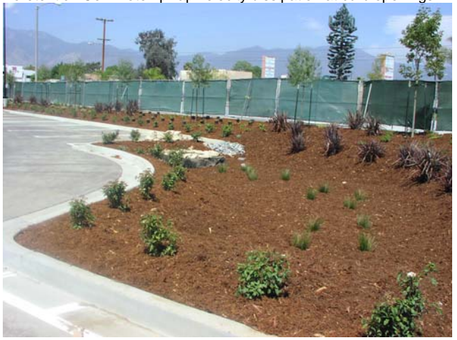
Bioretention Cells - 04/07/09

Installation of final layer of wood mulch as a part of the filter within the Bioretention Cell. Note rip-rap velocity dissipation at curb openings