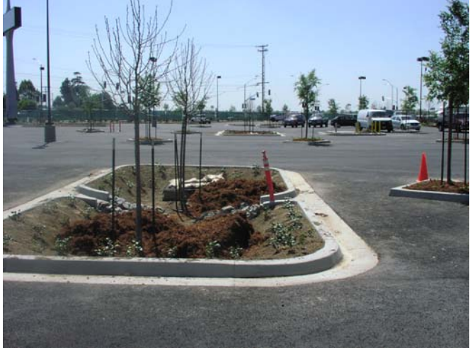
Bioretention Cells - 04/07/09

Installation of landscaping and irrigation within the Bioretention Cell. Note rip-rap velocity dissipation at inlet to Bioretention Cell.