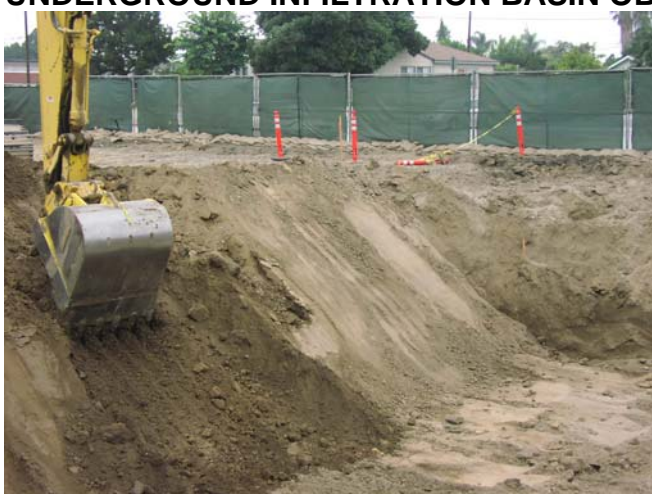
Underground Infiltration Basin – 09/08/08

Excavation of Underground Infiltration Basin No. 2 near the Southern property line adjacent to Lower Azusa Road.