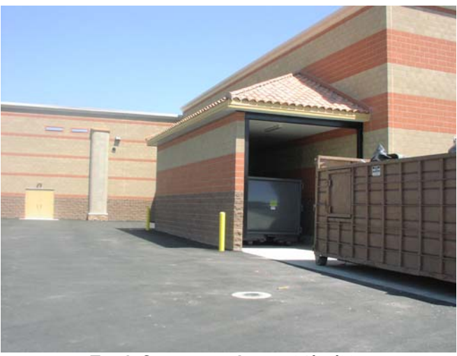
Trash Compactor Area -- 04/07/09

The area drain under the canopy is connected to an oil stop valve in case of an accidental spill and nuisance water drainage.