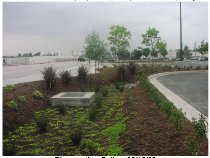
Bioretention Cells – 06/10/09 Completed bioretention cells

Installation of final layer of wood mulch as a part of the filter within the Bioretention Cell. Note rip-rap velocity dissipation at curb openings.