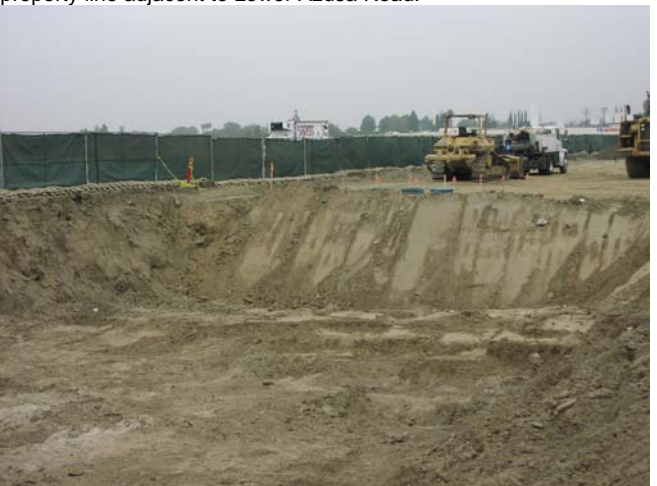
Underground Infiltration Basin – 09/08/08

property line adjacent to Lower Azusa Road.