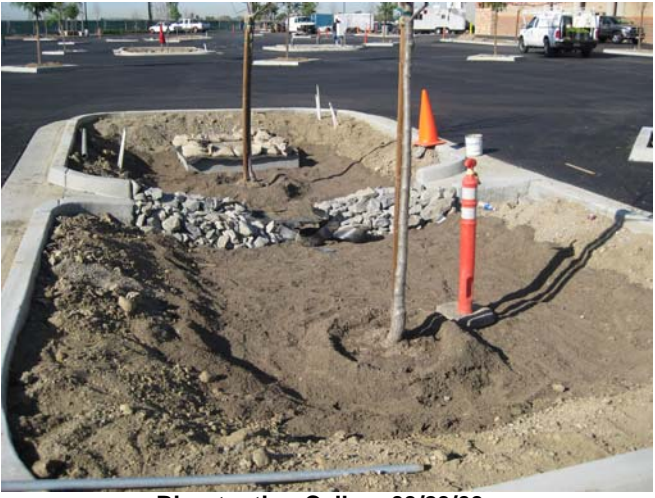
Bioretention Cells -- 03/23/09

Installation of final layer of wood mulch as a part of the filter within the Bioretention Cell. Note rip-rap velocity dissipation at curb openings.