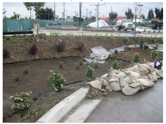
Bioretention Cells -- 03/04/09

Installation of Bioretention Cell. Note the amended soils have been installed and the area is nearly at finished grade.