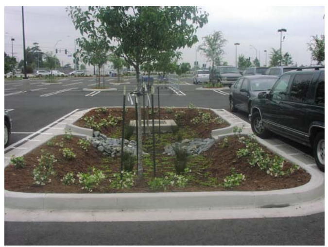
Bioretention Cells – 06/10/09 Completed bioretention cells