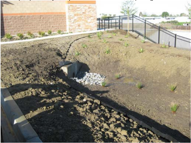
Bioretention Cells -- 03/23/09

Installation of landscaping and irrigation within the Bioretention Cell. Note rip-rap velocity dissipation installed at curb openings.