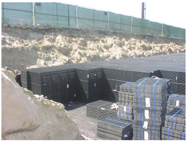
Underground Infiltration Basin – 09/11/08 Installation of Underground Basin No. 2, near the Southern property line Note the gravel base and permeable geo-fabric.