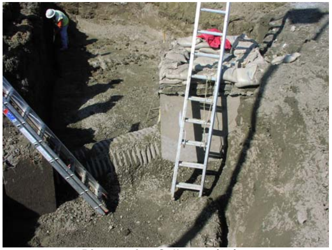
Bioretention Cells -- 02/11/09

Excavation of exiting soil at Bioretention Cell. Note the storm drain inlet and soil preparation for the impermeable vertical liner.