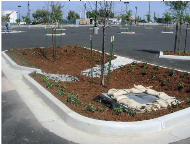
Bioretention Cells - 04/07/09

Installation of wood mulch as the top filter layer within the Bioretention Cell. Note rip-rap velocity dissipation at curb openings.