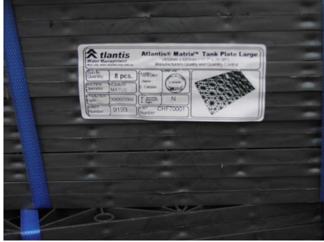
Underground Infiltration Basin - 09/08/08

Excavation of Underground Infiltration Basin No. 2 near the Southern property line adjacent to Lower Azusa Road.