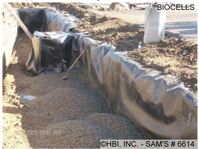
Bioretention Cells -- 02/12/09

Excavation of exiting soil at Bioretention Cell. Note the storm drain inlet and pipe for overflow discharges.