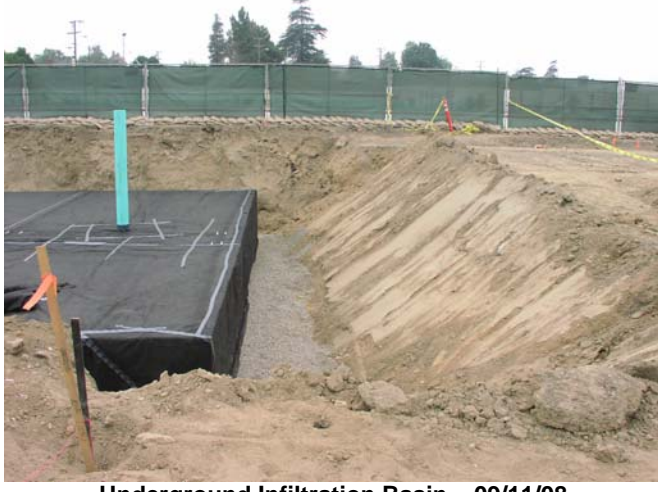
Underground Infiltration Basin – 09/11/08 Installation of Underground Basin No. 2. Please note the gravel base, permeable geo-fabric and cleanout portal.