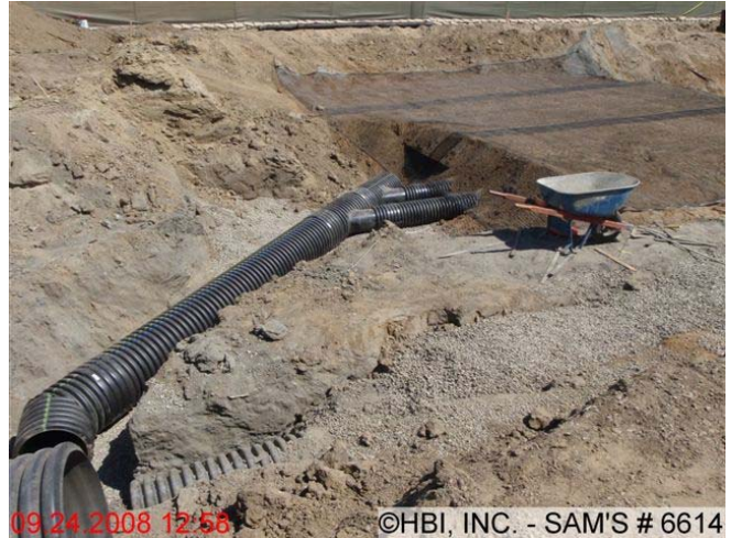
Underground Infiltration Basin – 09/24/08 Installation of the outlet/discharge pipes from Underground Infiltration Basin No. 1. Also note the geo-fabric over 1 foot of sand backfill.