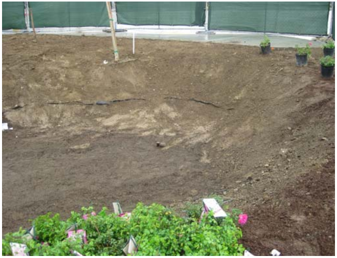
Bioretention Cells -- 03/04/09

Installation of Bioretention Cell. Note the gravel sub-base & the vertical impermeable liner.